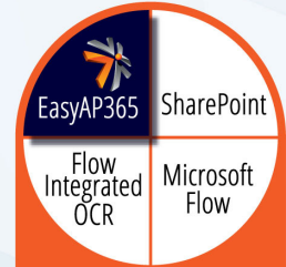
DynamicPoint leverages Office365 while focusing on ERP Integration