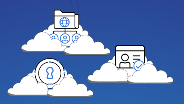
Journey to the Cloud