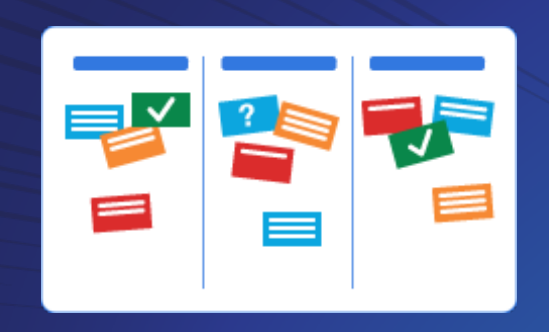
Modern Life Cycle